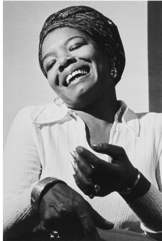
Chester Higgins Jr., Maya Angelou , 1969, © Chester Higgins, Courtesy of Peter Fetterman Gallery.

The Power of Photography is organized by Photographic Traveling Exhibitions, Los Angeles, CA. This presentation of The Power of Photography is made possible with generous support from The Ronald C. and Kristine Pietersma Family Trust.