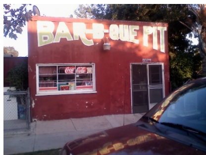
The Bar-B-Que Pit in Santa Ana, California.